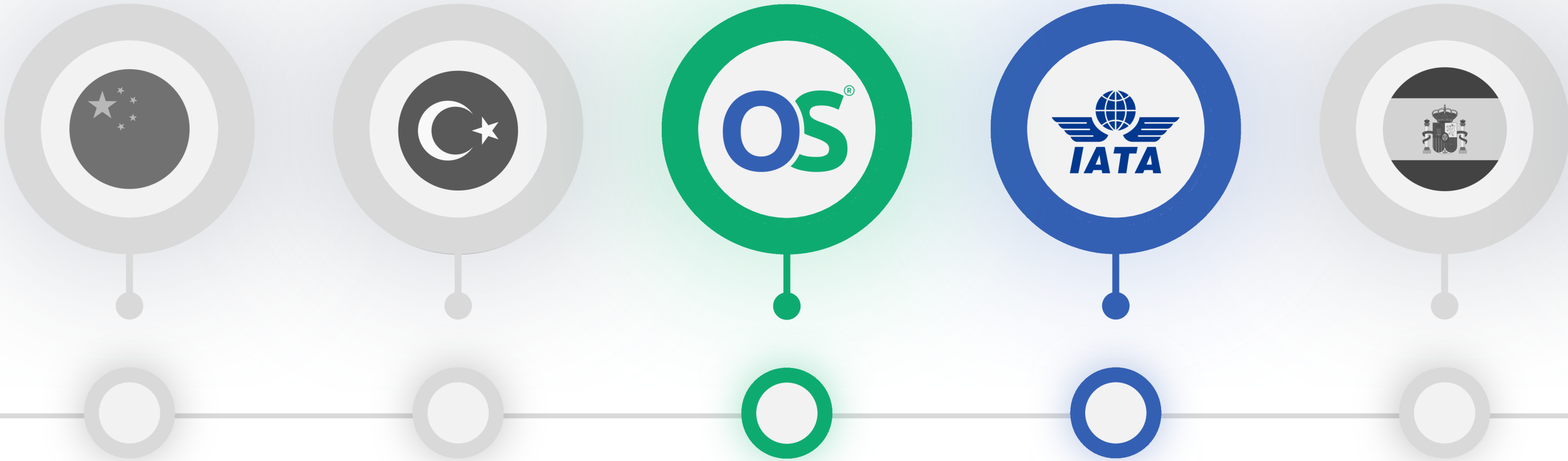
Office in China

Online Logistics System is an automated logistics system created to solve FEA tasks online